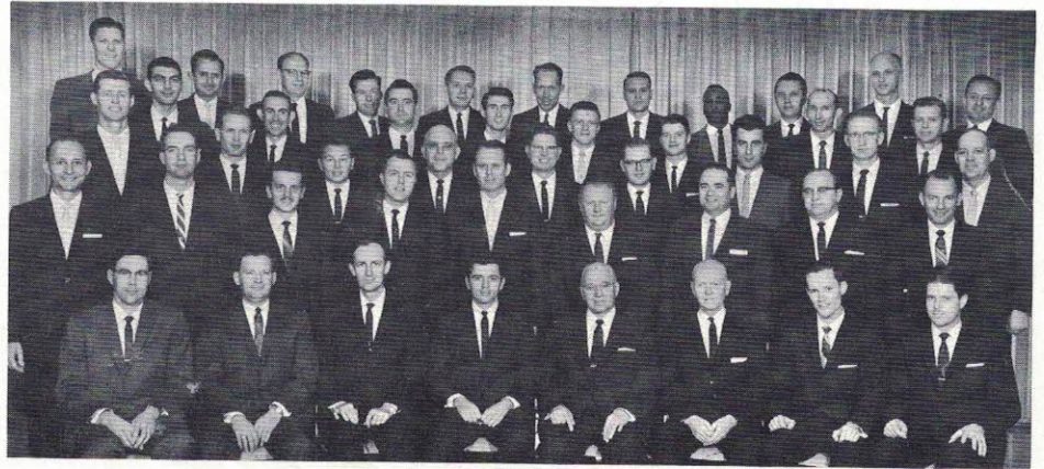
All of the Ministers of God who attended the 1962 Conference.