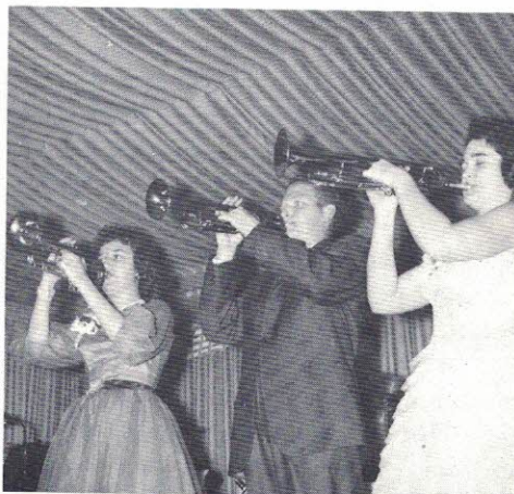
Trumpet trio turns in top performance.

All in all, everyone agreed, "Best dance ever," and when the last dance was announced, expressions of dismay and regret were heard at the shortness of the evening. All wondered how time had flown by so rapidly—the answer: everyone had a terrifically enjoyable time!