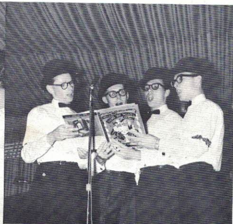
Barbershop quartet brings back fond memories.