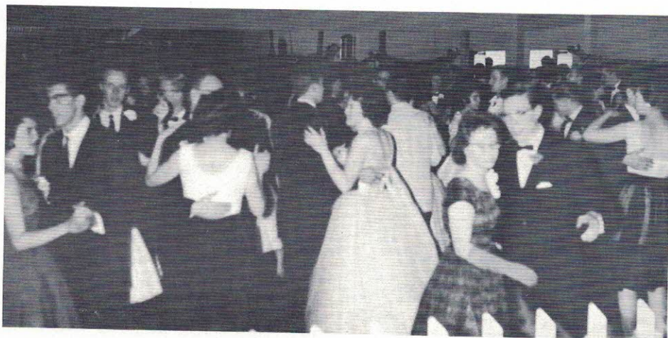
This crowded floor pictures everyone's enthusiasm and enjoyment of the Ministerial Ball!

This is one more example of how we are provided with the most excellent tools to give us an abundantly full and well-rounded life at Ambassador.